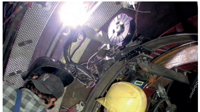
Penstock Kaprun, Austria. MCE staff control the fully mechanized GTAW hot wire process