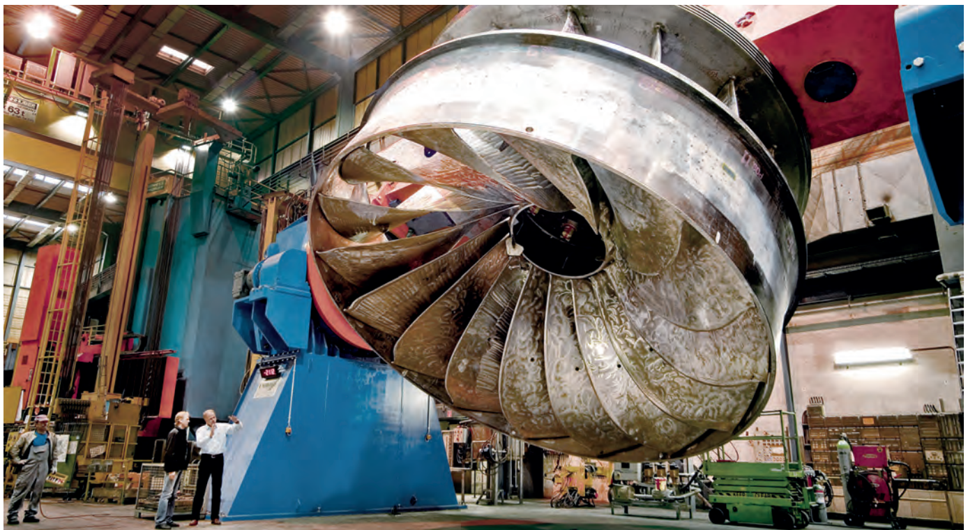
Francis turbine