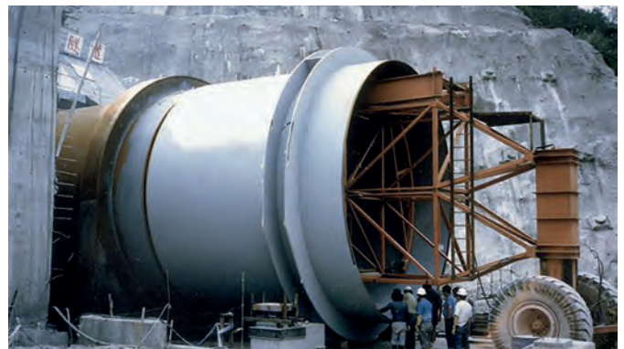
Prefabrication of the Penstock Kaprun, Austria. Steel grade S 690 Q, ASTM A514 Gr.F