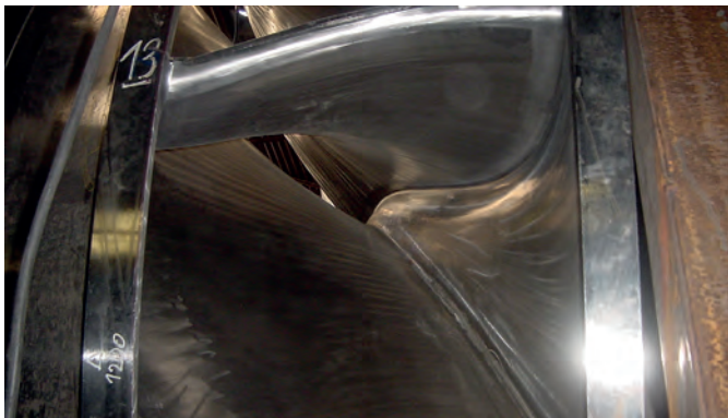
Close up view on a Francis turbine.