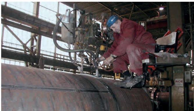
Prefabrication of the Penstock Kaprun, Austria. Steel grade S 690 Q, STM A514 Gr.F