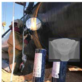
FOX CEL and FOX CEL 70-P with TERRA MP 350 RC

Perfect pipeline weld performed with FOX CEL and FOX CEL 70-P with TERRA MP 350 RC on an 88 inches very large pipeline. Optimal bead shape, smooth transitions and perfect root and cap passes.